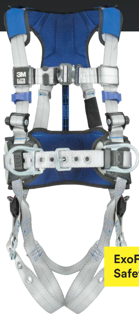
ExoFit™ X100 Safety Harness