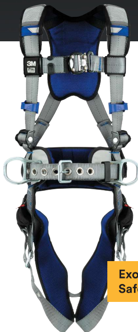
ExoFit™ X200 Safety Harness