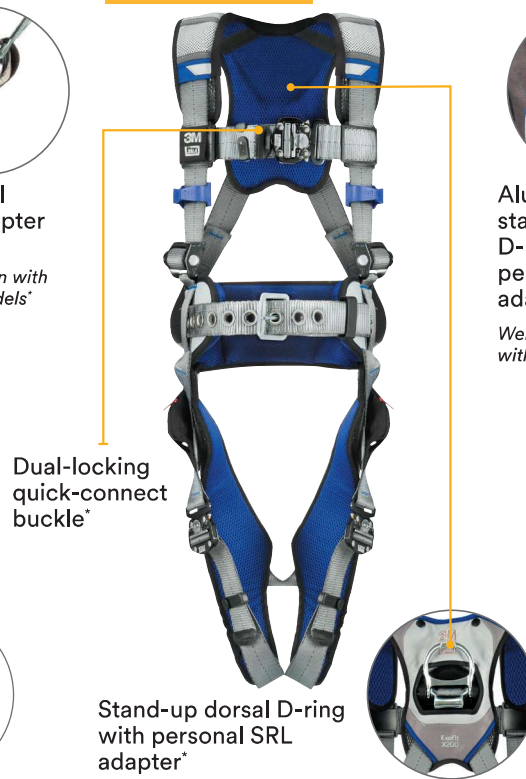
ExoFit™ X200 Safety Harness