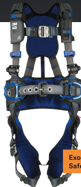
ExoFit™ X300 Safety Harness